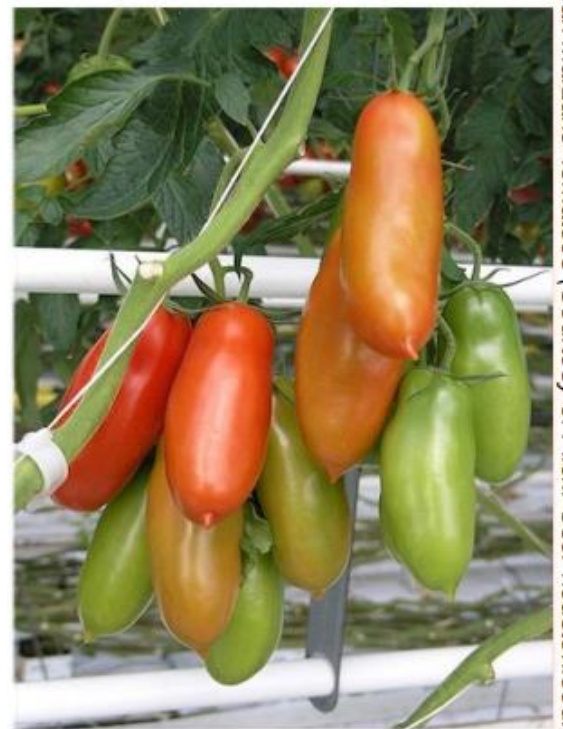
San Marzano Tomatoes

Too tired to whip up a meal tonight? No problem. Rosedale offers carryout!